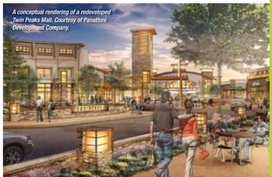
A conceptual rendering of a redeveloped Twin Peaks Mall.

In 2007, Panattoni Development Company, Inc., purchased Twin Peaks Mall with the intent of redeveloping it into a thriving lifestyle center. They are seeking to create a partnership with the City of Longmont. Now that the mall area has been declared "blighted," the City Council, acting as the Longmont Urban Renewal Authority, in consultation with Leland Consulting Group, has authorized the preparation of an updated urban renewal plan for the Twin