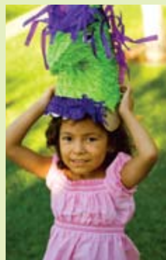
Cinco de Mayo event on Saturday, May 2, noon to 6 p.m. at Roosevelt Park. The event includes the 7th annual Chihuahua Beauty Contest, New Car Exhibit, Kids' Activities, Resource Booths, Food, Music & Dance, Art and more.